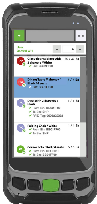
Fast and more efficient execution of warehouse activities from mobile devices